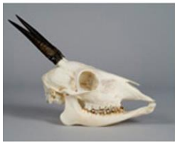
Real Skulls and Skeletons