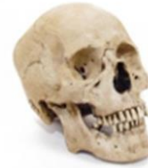
Replica Skulls and Skeletons